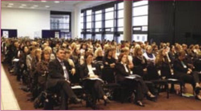
A view of the conference