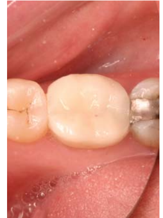
FIGURE 7: Cemented restoration.

After the existing restoration was removed, the remaining lingual cusps were reduced by 1.5mm (2mm over functional cusps) and all cavity margins prepared to a 90° butt joint and finished with Soflex discs. Internal line angles were rounded and smoothed, and care was taken to ensure that the remaining axial tooth walls diverged occlusally without undercut ( Figure 3 ).