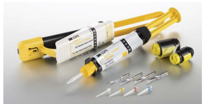
FIGURE 6: Rely X Unicem (3M) is the self-etching, self-curing resin cement used in this case.

Alternatively, a silicone index for the fabrication of an interim restoration can be made by building up the tooth to contour in the mouth, or on a study cast with wax or old composite resin. A layer of bonding resin can be applied to the preparation, followed by the placement of the matrix filled with