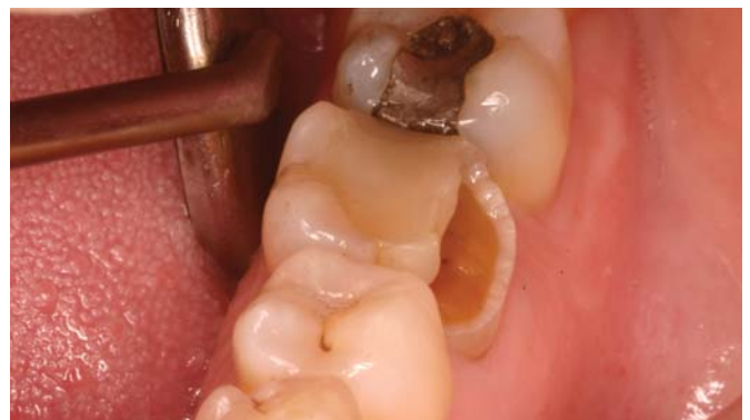
FIGURE 2: Patient presentation.