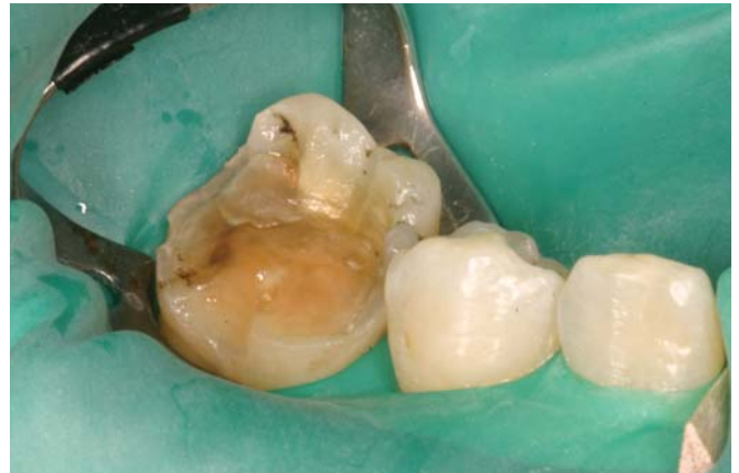
FIGURE 1: An indirect restoration may be considered when a substantial three-walled cavity defect greater than one-half to two-thirds of the intercuspal width is present following tooth fracture and the removal of any plastic restorative material.

An indirect restoration may be considered when a substantial three-walled cavity defect greater than one-half to two-thirds of the intercuspal width is present following tooth fracture and the removal of any plastic restorative material ( Figure 1 ). The decision to use composite resin to restore such a defect will be informed by key clinical criteria being met in the course of tooth assessment: