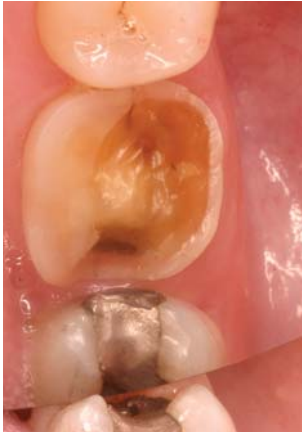
FIGURE 3: Tooth preparation.