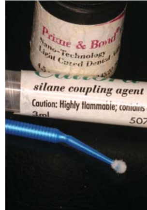
FIGURE 5: Silanating agent.