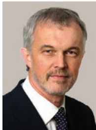
Dr Eamon Croke President of the Dental Council of Ireland

IPC requires training and education for all members of the team; team training underpinned by shared attitudes and values (Training and Education section). The new Code summarises the need for risk assessment/audit and standards; these practices are universally acknowledged as essential to quality assurance in all healthcare and will probably play an important role in future practice inspection (Risk Assessment/Audit and Standards section). These are new skills for many DHCWs but with support, they should not prove intimidating. The recently published Dental Council Guide to Continuing Professional Development requirements (April 2015) recommends audit and governance as core CPD competencies.