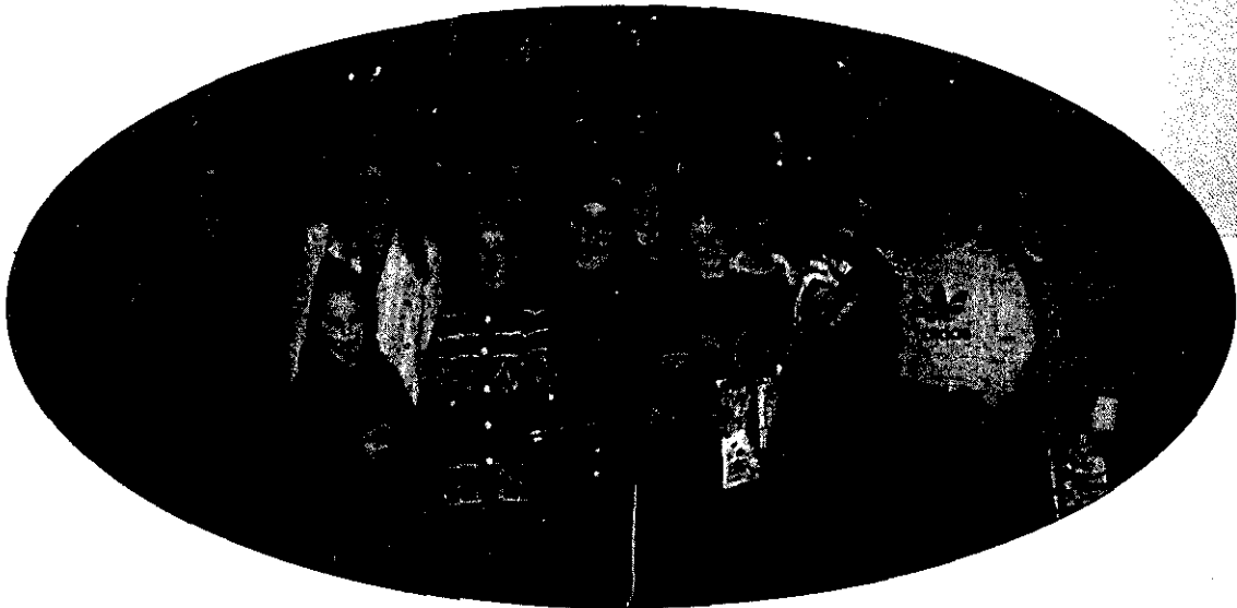
A group of Carol Singers who entertained the patients, Christmas 1997.

Events organised by the Committee each year include, Annual Field Day, Sponsored Walk, Sponsored Swim and Raffles. The Committee also organise entertainment for the patients in the Hospital, i.e. Bingo, Music and Outings for the patients.