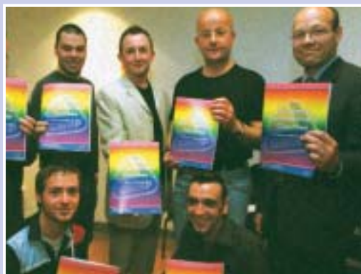
PDC report launch

well as providing support over the phone to men on issues from sexual health screenings to isolation and relationship problems. Outreach workers are also involved in community development and work closely with many groups providing training workshops, advice and referrals. In 2002 many workshops were provided to groups, agencies and health board staff and university courses on addiction and social studies.