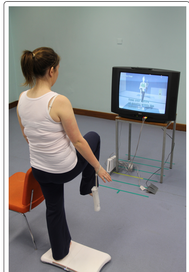
Figure 1 The Nintendo Wii Fit Plus®. The participant stands on the Wii balance board which monitors centre of pressure and reconstructs it visually on the television monitor as a red dot within a yellow area. A variety of exercises and games are available to retrain balance and encourage head movement. Stepping exercises can also be performed encouraging stopping and changing direction, in which the vestibular system has a role. Written consent to reproduce the image was provided by the subject in the photo.

The rehabilitation community is beginning to investigate the NWFP in the area of balance retraining [16,17]. Anecdotal reports indicate the NWFP is being used in