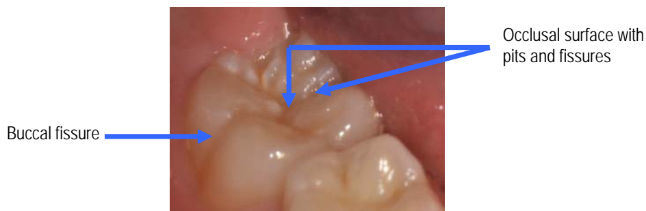
Figure 1.1: Diagram of pits and fissures on a molar tooth

Pit and fissure sealants are materials that are applied to the pits and fissure surfaces of teeth to create a thin barrier which protects the sealed surface from decay. Fissure sealant materials fall into two broad categories: resin-based sealants and glass ionomer sealants. Resin-based sealants are based on acrylic (methacrylate), may or may not contain filler particles or fluoride, and the setting reaction can be automatic (auto-polymerised) or light activated (light-polymerised). Low-viscosity resin-based restorative materials (flowable composites) have also been used as fissure sealants. 10-14 Glass ionomer sealants have evolved from glass ionomer cements, which can adhere directly to tooth substance. 15 Glass ionomer materials release fluoride over time and have the advantage of being less sensitive to moisture contamination than resin-based materials, making them a potential alternative to resin-based sealants when moisture control is an issue. 16 Hybrid materials which incorporate features of both resin and glass ionomer, e.g. polyacid-modified resins (compomers) and resin-modified glass ionomers, have also been developed and used as pit and fissure sealants.