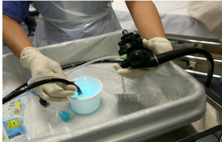
Figure 6-2: Aspirating the enzymatic detergent through the suction/biopsy channel