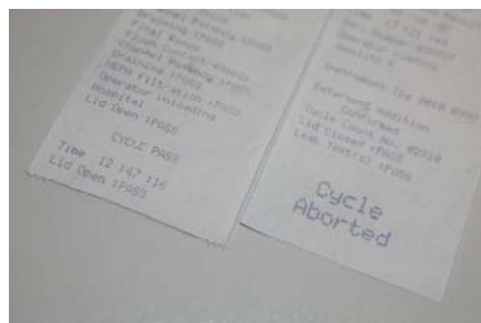
Figure 7-3: AER record