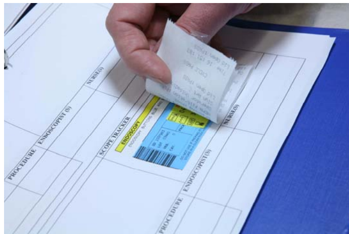
Figure 13-1: Manual traceability system