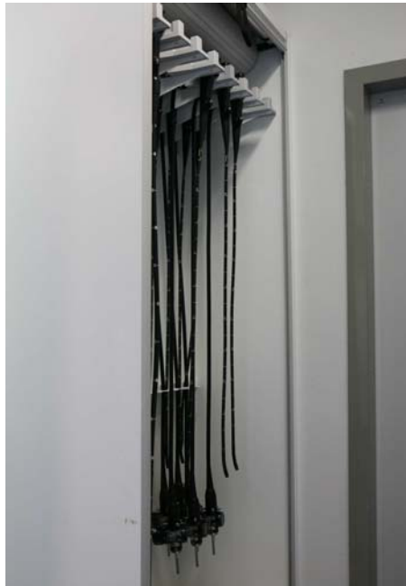
Figure 11-1: Storage

Note: Prior to storage at the end of the day the rubber seals of the suction and air/water valve should be lubricated sparingly with silicone oil in accordance with manufacturers' instructions.