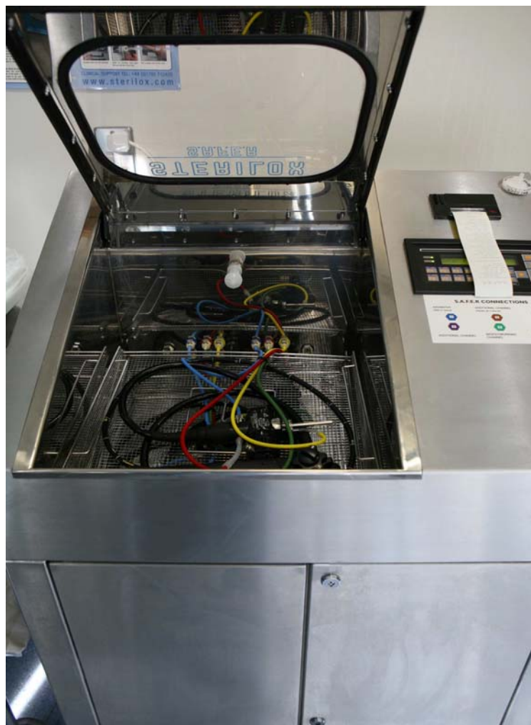
Figure 3-1 Automated Endoscope Reprocessor (AER)