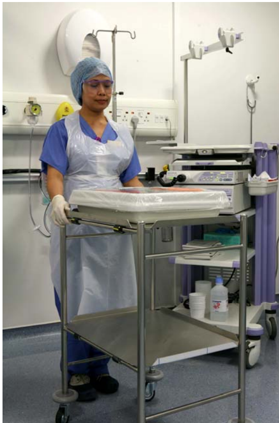
Figure 5-1 Transport of contaminated endoscopes and accessories