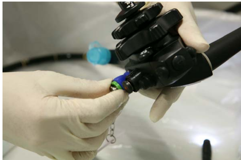
Figure 6-5: Removing valves/buttons and caps

Note: Where valves/buttons/caps are interchangeable it is preferable to have extra valves/buttons/caps to allow more time to ensure that adequate cleaning is performed prior to disinfection/sterilisation.