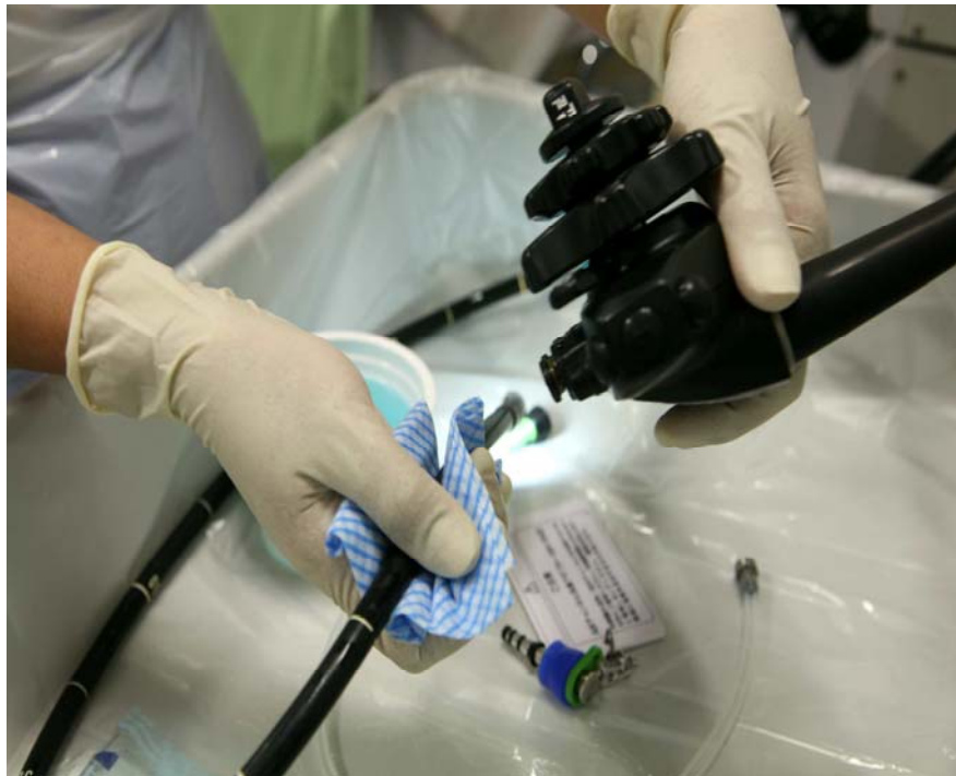
Figure 6-1: Wiping the insertion tube