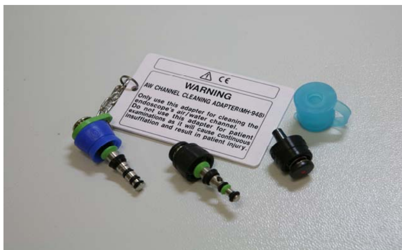
Figure 12-1: Accessories