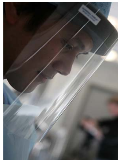
Figure 4-2: Face shield