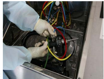
Figure 7-1: Attaching the endoscope channels