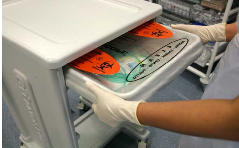
Figure 6-6: Transporting to the cleaning area