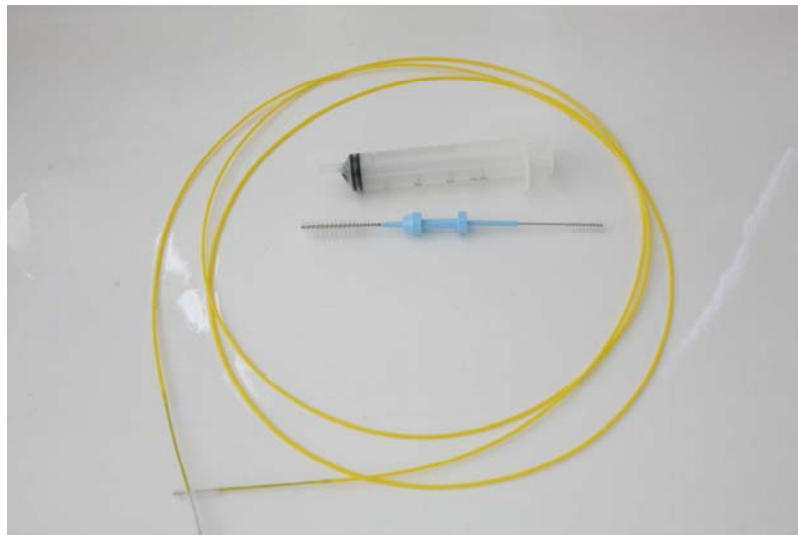
Figure 6-10: Brushes