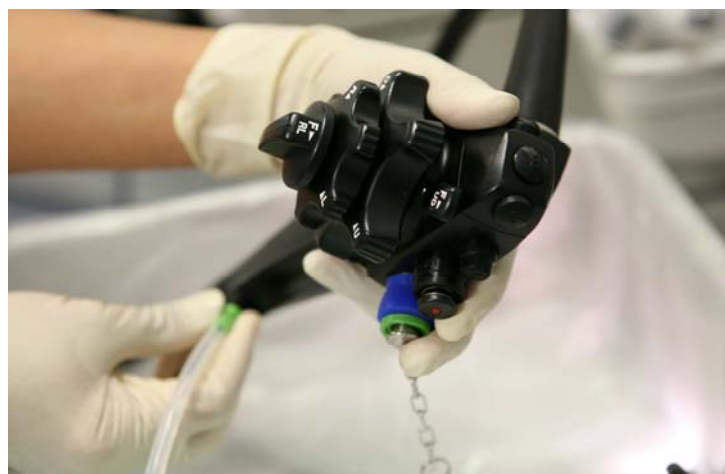
Figure 6-3: Purging air/water channels