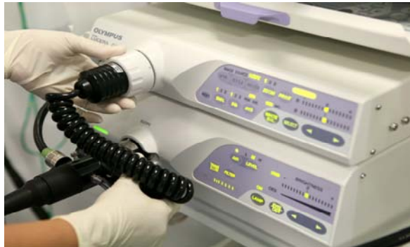
Figure 6-4: Removing the endoscope from the light source