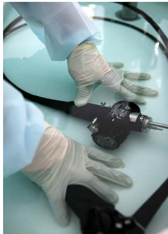
Figure 6-8: Immersing the endoscope