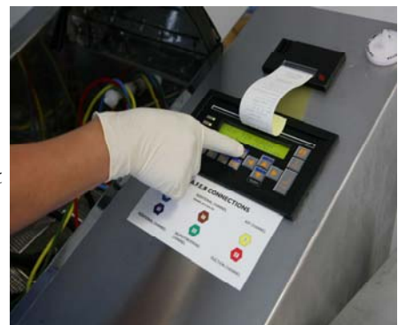
Figure 7-2: Selecting the cycle