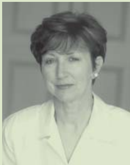
Olivia O'Leary, Broadcaster and Journalist