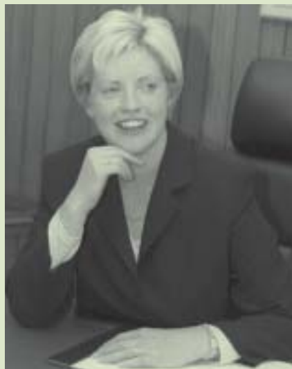
Ms. Mary Coughlan T.D., Minister for Social and Family Affairs

This year we celebrate the 10th Anniversary of the International Year of the Family. This will stimulate a worldwide focus on families and family life and especially on developments over the past 10 years.